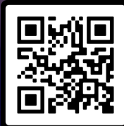
Gospel of Mark